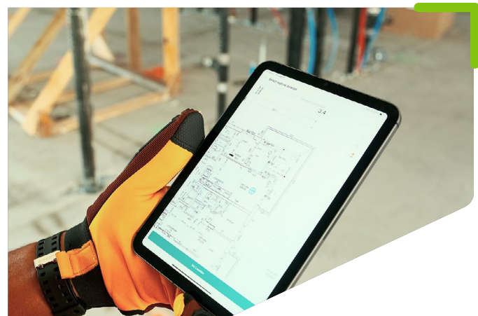
Hexagon GoCapture App – Photo, 360 Photo, & Video