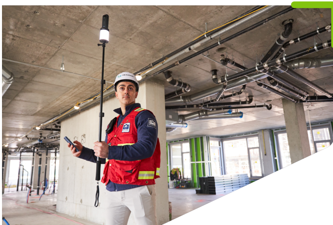
360-degree Photo Documentation