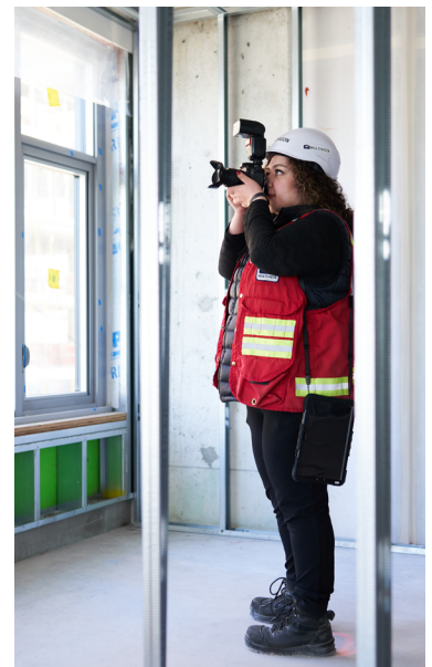
Photo Documentation in context of plans or models